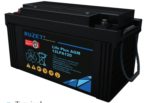
■ Terminal Unit: mm [inches]