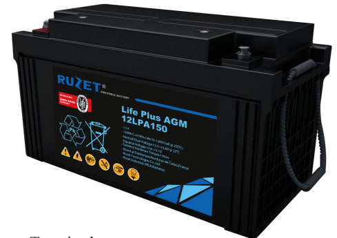
■ Terminal Unit: mm [inches]